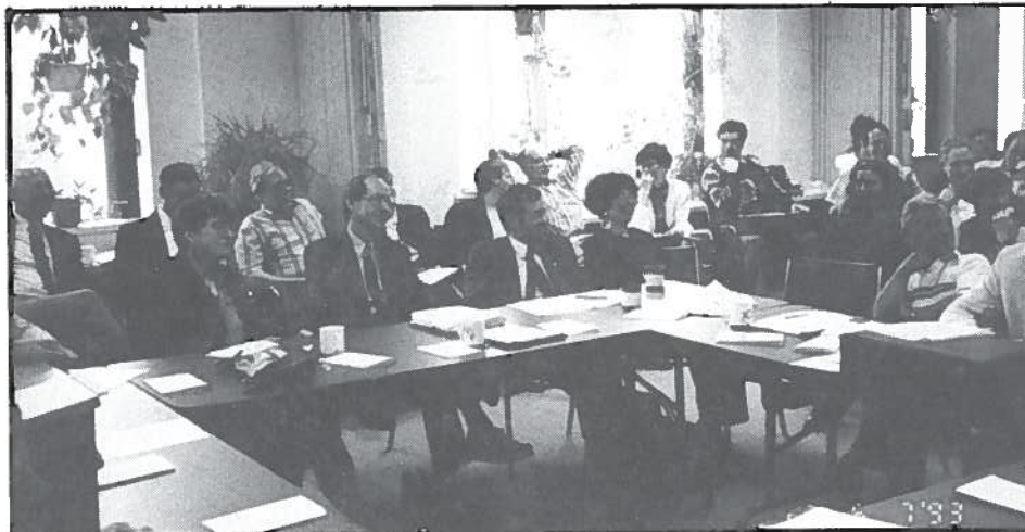
ICS Junior and Senior Members were invited to join the joint Board/Senate meetings to hear the Review Committee reports and participate in the discussion which followed.

Ongoing trust and wisdom are required by all to... carry forward the Institute's ministry of scholarly leadership.