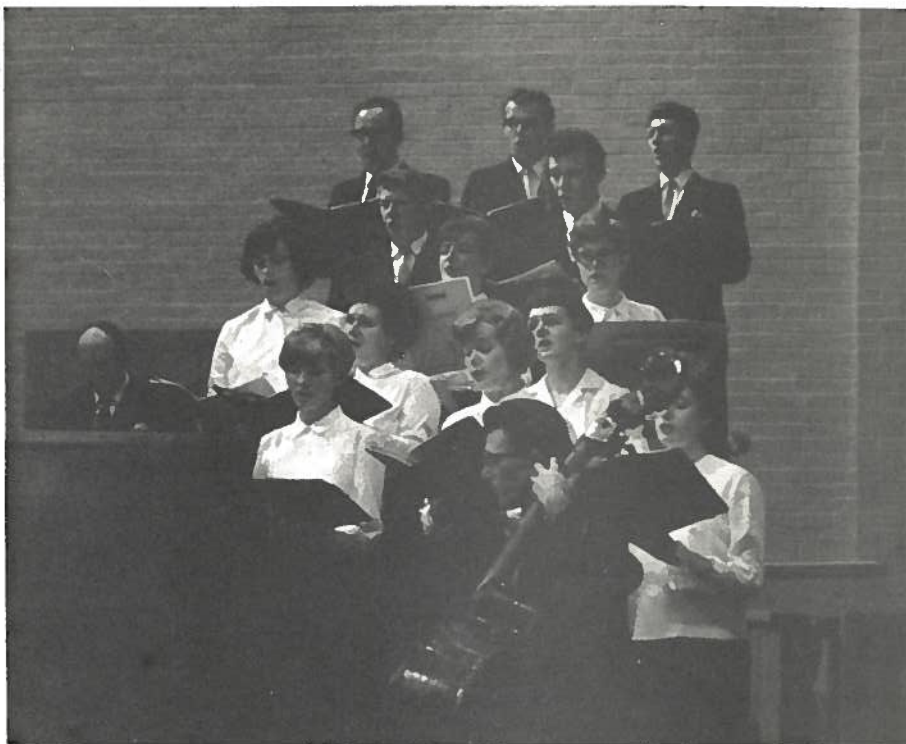
Choir and chamber orchestra added to the high style of the convocation, held at Weston Church.