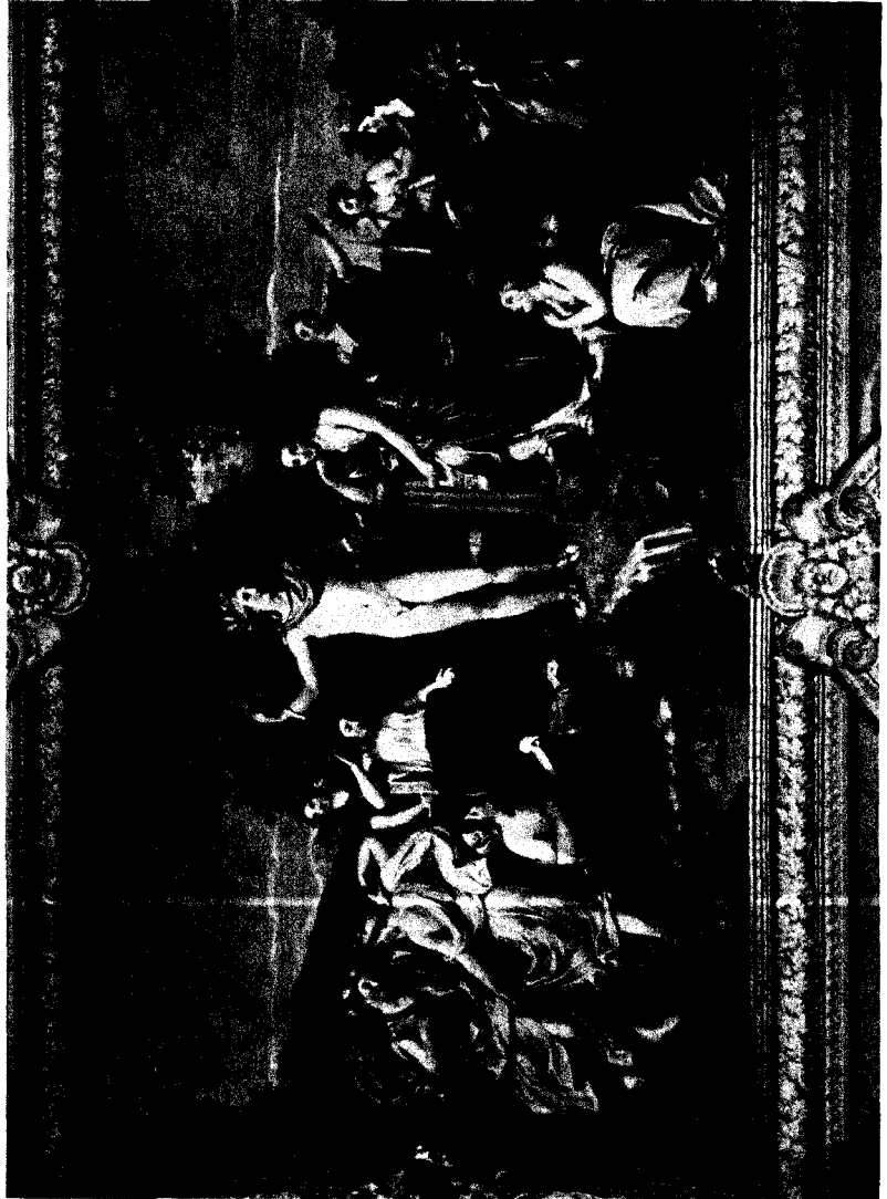
The Parnassus Fresco of Apollo, Mnemosyne, and the Nine Muses: Villa Albani (now Torlonia), Rome

Mengs slips into this position more by way of practical, pedagogical concerns than of carefully argued, philosophical reasons (1:40, 78), the problematic import for theory of art is still serious: canonic art becomes essentially a kind of palimpsest.