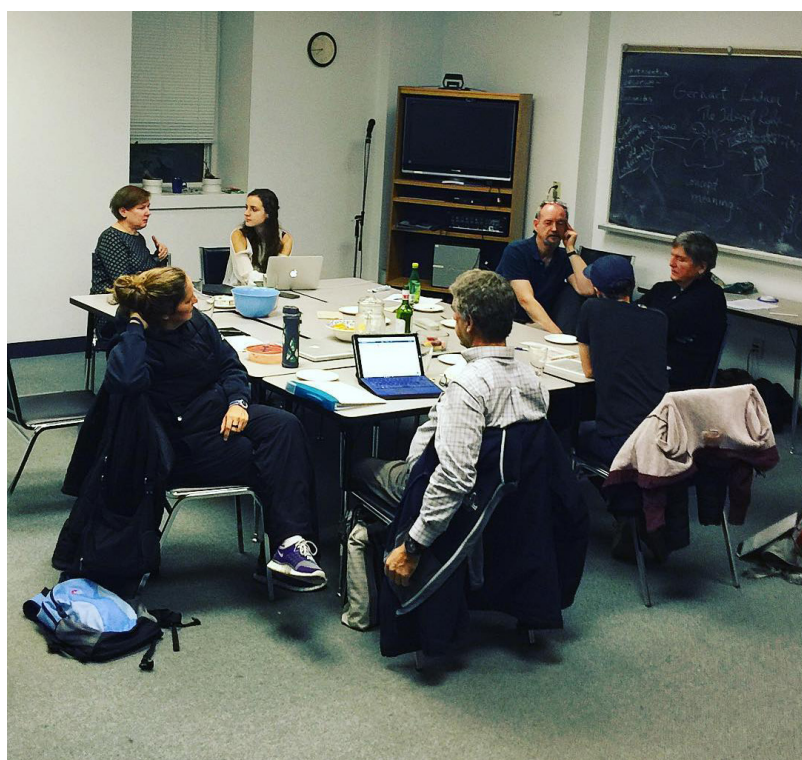
Senior and Junior Members participating in a pilot ICS Vocational Wayfinding class